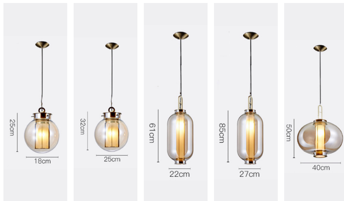
WL10887-1 WL10887-2 WL10887-3 WL10887-4 WL10887-5